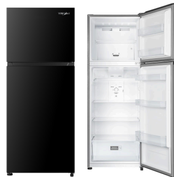
(Draft version, final photo with Whirlpool and Zen Inverter logo updated )